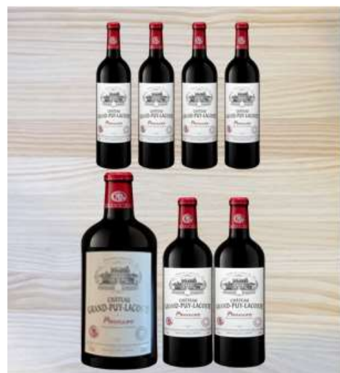
Caisse Variation (9L)